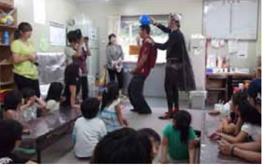
He entertained children by performance

He is expected his vigorous support at disaster areas. He is looking forward to helping as much as he can there.